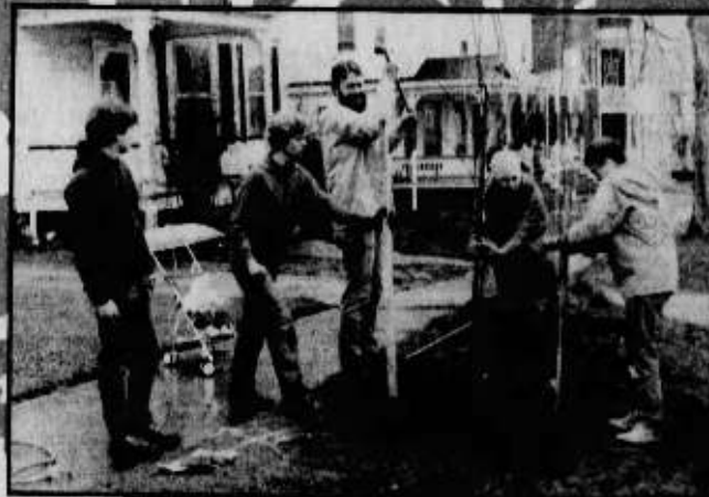
One of almost 400 trees planted by volunteers this past spring

Meet at these locations Saturday, 8 a.m., to help plant trees 103 Loomis St. 52 Isham St. 46 Catherine St.