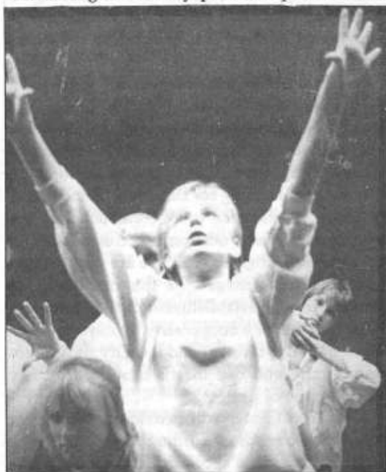
Members of Contrast, a dance group.

Programs for Young Children — Child care is in scarce supply in Vermont, where for every five children needing care only 1.8 can find a space and Burlington is no exception. We believe that child care is a service for children and parents which strengthens, supports and complements the family, the school and the community and that the availability of quality, affordable child care is a priority. For these reasons, the Youth Office initiated the development of a new child care center in the downtown area, now called The Burlington Children's Space . A federal block grant appropriated by the Mayor and approval by the Board of Aldermen covered the one-time construction cost of this center. Not only has the Children's Space become self-sufficient by working with the private sector but the City receives rent from the Children's Space for its use of City property. The success of the Children's Space is displayed through its variety of programs and ability to have a well-paid (for child care) highly qualified staff while offering the lowest child care rates in Burlington. Thanks to a sliding fee scale, approximately half of the families served by the Children's Space are of low to moderate income. The center also offers infant and part-time care and has a significant percentage of special needs and protective service children. All of this is possible through the many partnerships the Child-